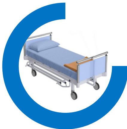
HOSPITAL BED SHEET