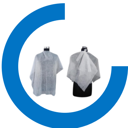
DISPOSABLE CATING SHEET