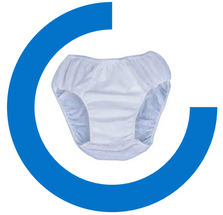
DISPOSABLE SPUNLACE PANTY