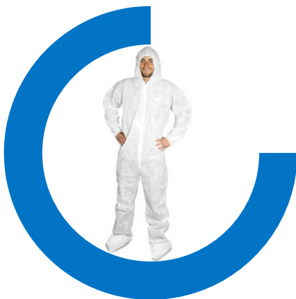
NON WOVEN COVERALL