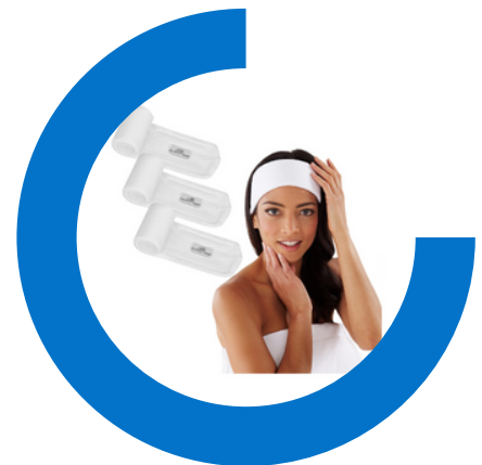
TOWEL HEAD BAND