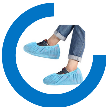
DISPOSABLE SHOE COVER