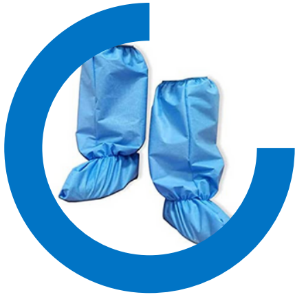
LONG SHOE COVER